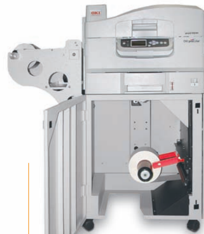
Continuous media feed allows for nonstop imaging with a high utilization rate

The pro510DW from OKI Printing Solutions is a complete—and ideal—web press solution for a fraction of the cost of other digital presses. Starting with its low acquisition cost and low total cost of ownership, the pro510DW enables you to lower production costs, inventory and waste—all while satisfying more requirements for short-run jobs, improving your job margins and growing revenue.