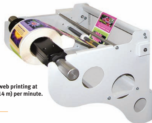
Continuous web printing at up to 30' (9.14 m) per minute.