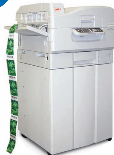
Width flexibility from 3.94" (100 mm) up to 12.9" (327.7 mm)