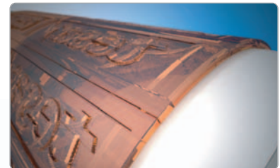
tesa Softprint® Secure

Specially developed with the most demanding process parameters in mind, tesa Softprint® Secure takes edge security to a new level.