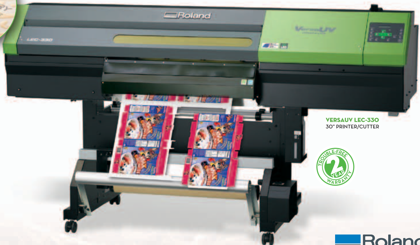
VERSAUV LEC-330 30" PRINTER/CUTTER