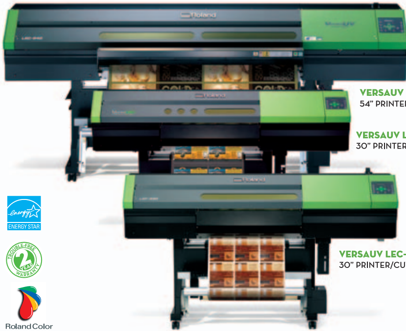
VERSAUV LEC-540 54" PRINTER/CUTTER