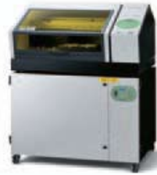
▲ Optional air filtration** system and stand