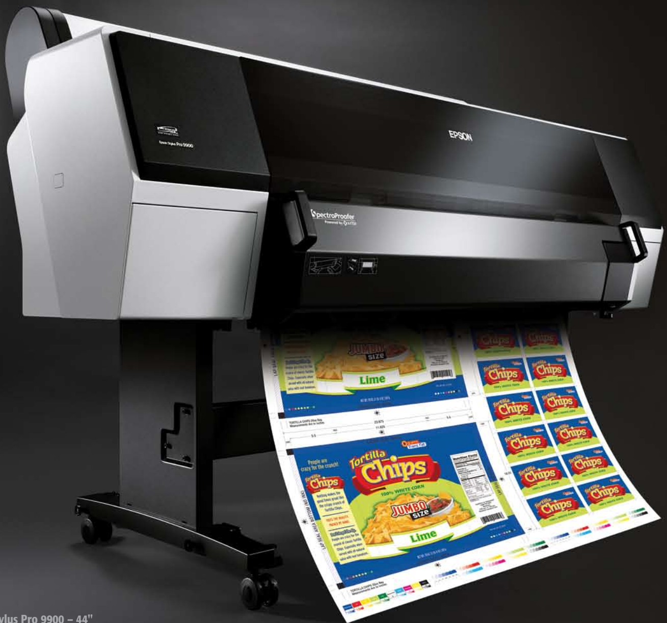
Epson Stylus Pro 9900 – 44"