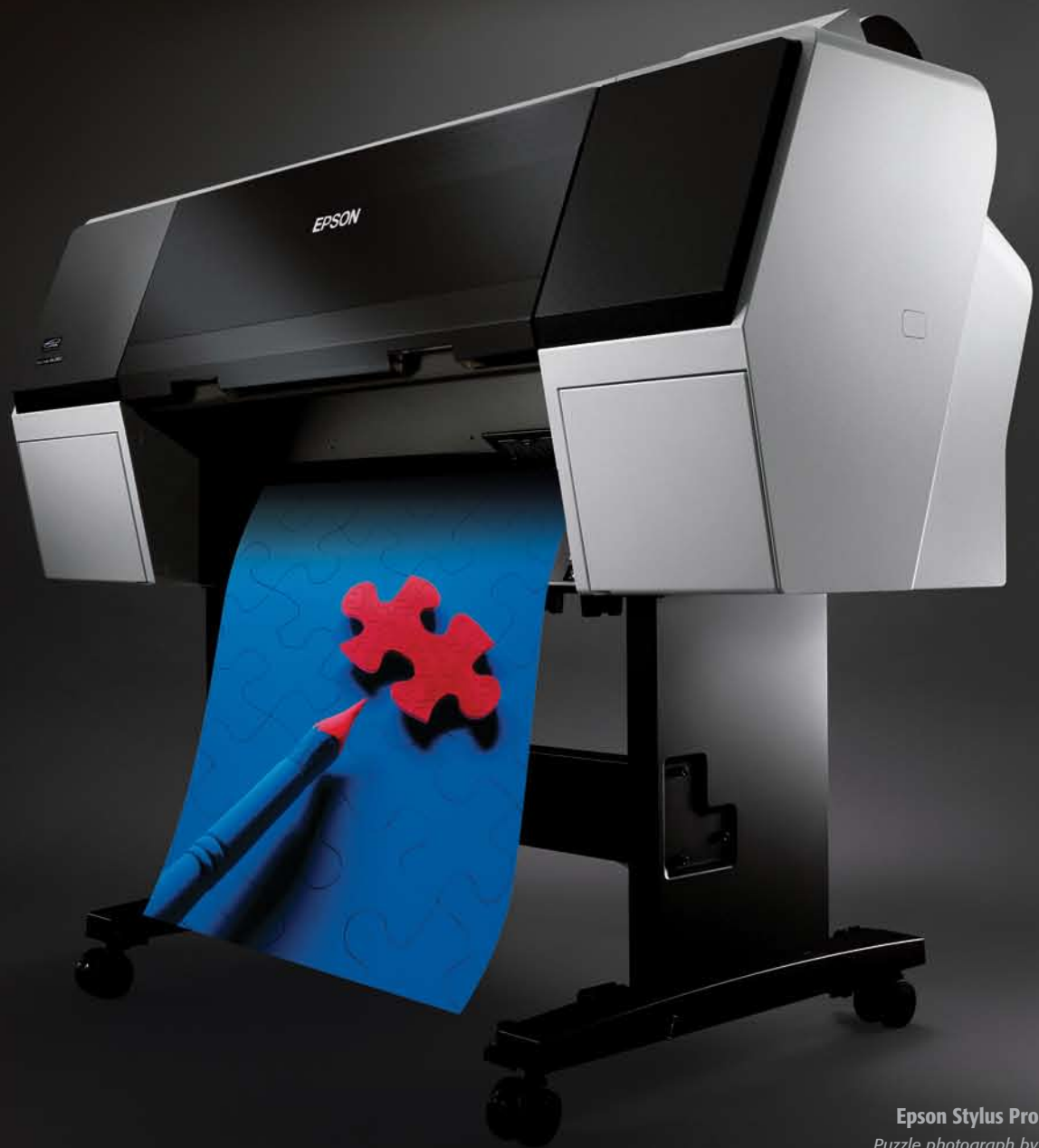
Epson Stylus Pro 7900 – 24" Puzzle photograph by Jeff Schewe